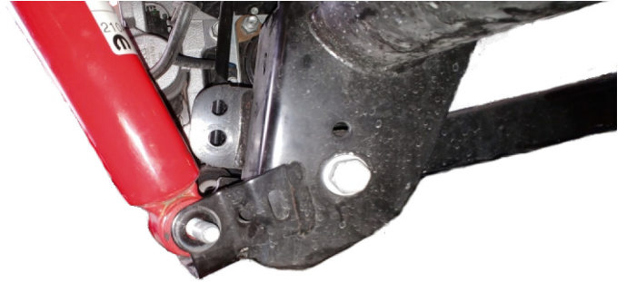
Image 3. New and Existing Hole in Sway Bar Mounting Tab