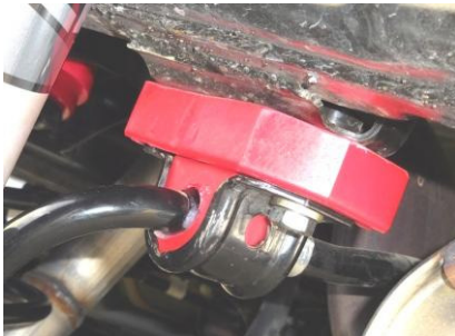
Image 2. Rear Sway Bar Spacer and Bushing