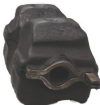
OLD O.E. RUBBER INSERT