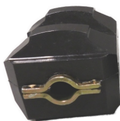
NEW POLYURETHANE INSERT

Reassembling motor mounts: This motor mount insert can go into the metal shells one way. Put the polyurethane motor mount insert into the metal shell. Align the bottom backing plate making sure that all bolt holes line up. HINT: Due to the many different metal configurations from foreign and domestic manufacturers, it may be helpful to apply a thin coating of grease or dishwashing detergent to the polyurethane insert, at metal contact points before installing. This will allow the insert to seat, in turn allowing proper bolt alignment.