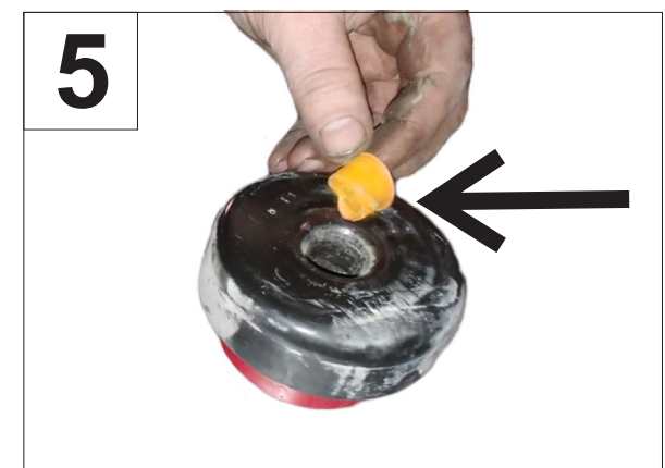
5 Discard orange plastic bolt retainers from top side of all body mounts