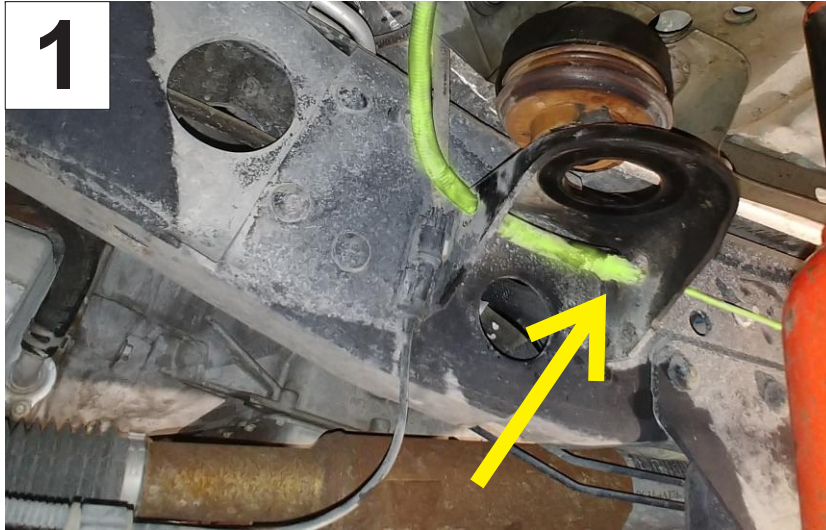
1 Release park brake cable clip from position 2 frame perch on driver's side before lifting body.