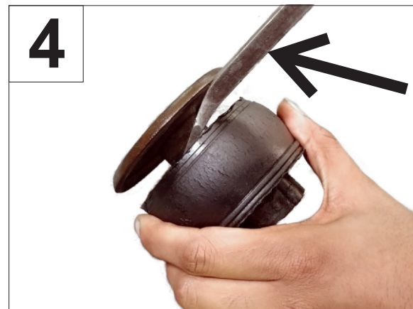
4 Use spray lube and pry-bar to remove old rubber body mount from O.E. metal.