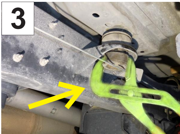
3 Use large chanal tongue and groove plyers to separate bottom half of body mount.