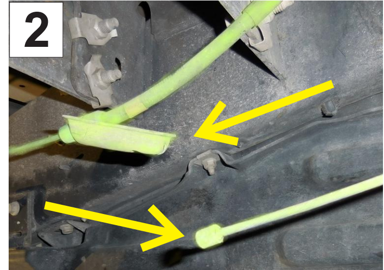
2 Unhook park brake cable located near rear main spring eye on driver's side.